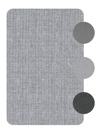
TC CHINCHILLA GREY 1