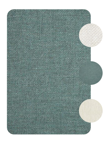
TC ARUBA 1